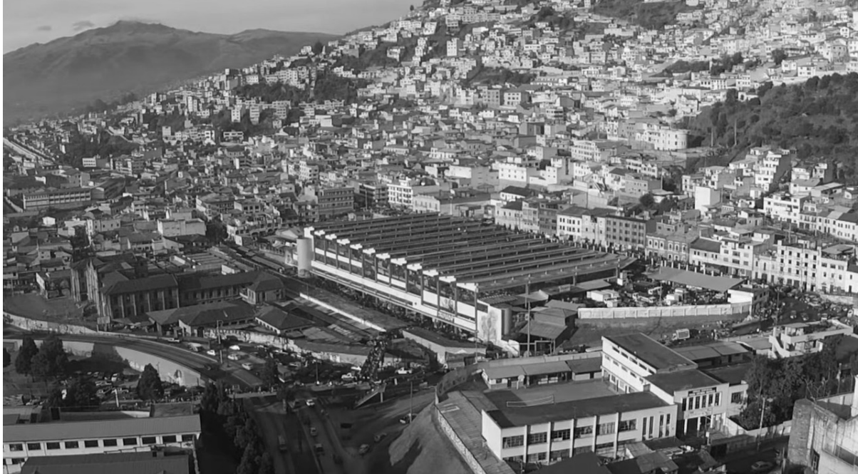
Still from Mercado San Roque: Una casa para todos , 2015, https://youtu.be/_ybmzxPEQg , accessed 16.09.2018

Updated copy of this document will be given during the workshop introduction.