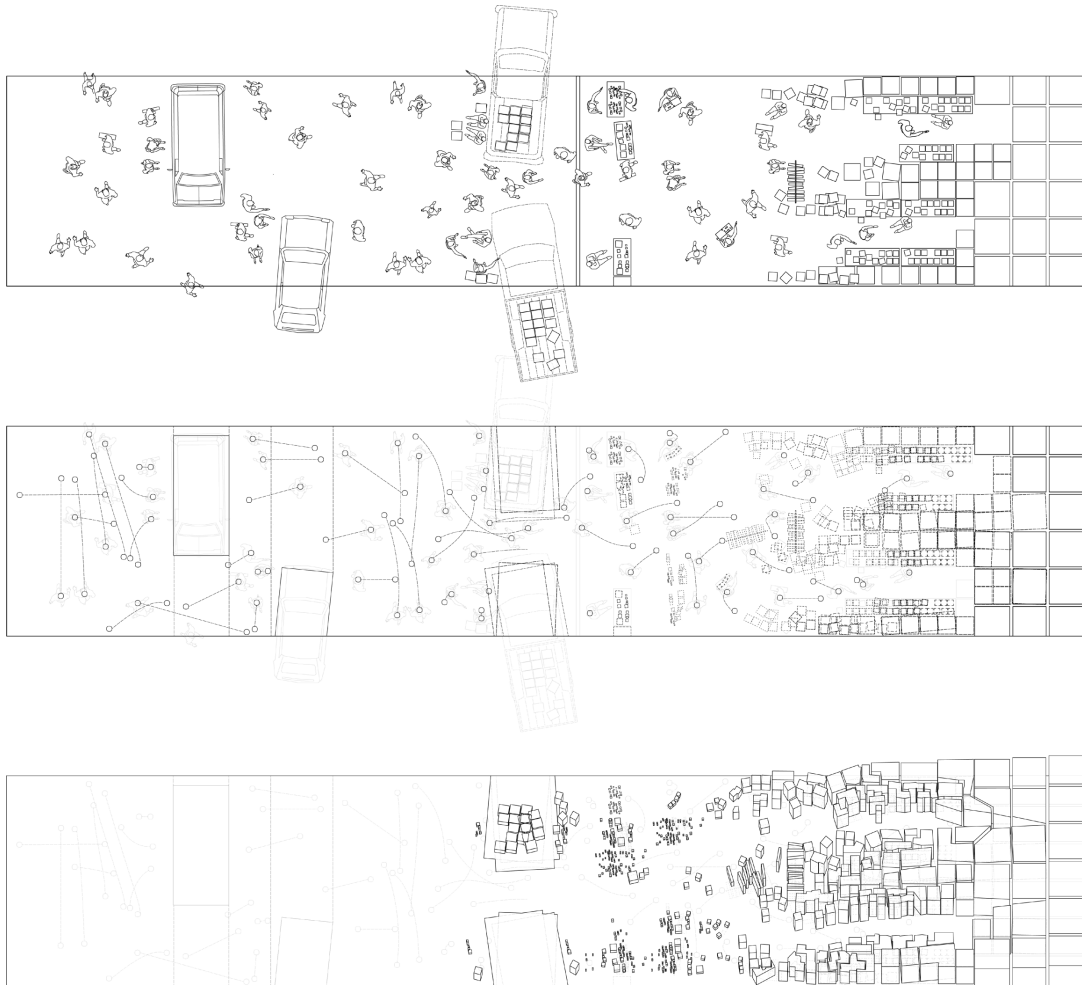
Example 3. Operation of the Kampala market compartment over the course of a day, study by Yinong Tao and Tiantian Lou.