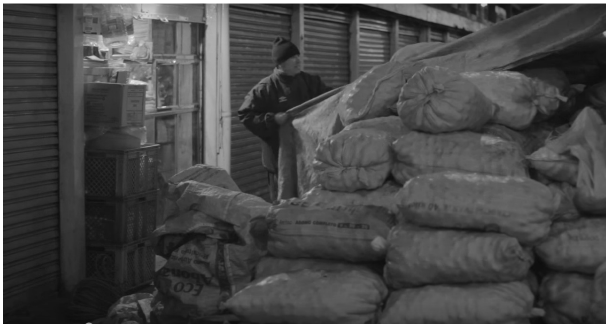
Still from Mercado San Roque: Una casa para todos, 2015, https://youtu.be/_ybmzxPEQg , accessed 16.09.2018

note, until Thursday the 4 October Drive material will continue to be edited. Please don't change/delete files from our shared folder.