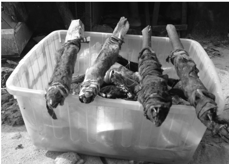
Animal skins on sticks in Ajah market, Nigeria, photo by author in July 2017 This is an element of traditional medicine practice of the Yoruba tribe in South Western Nigeria.

How is the element formed? What is its relationship to the rest of the site? How is this relationship transforming over time? Where does the product/practice come from? Who are the different participants of a process? Which distant geographies is it related to and how does it get to San Roque?